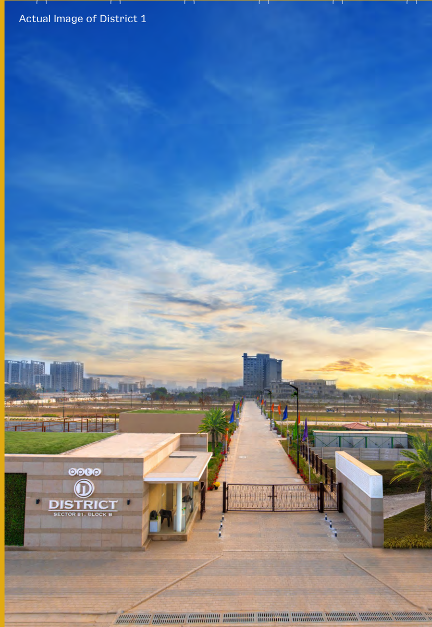
Actual Image of District 1