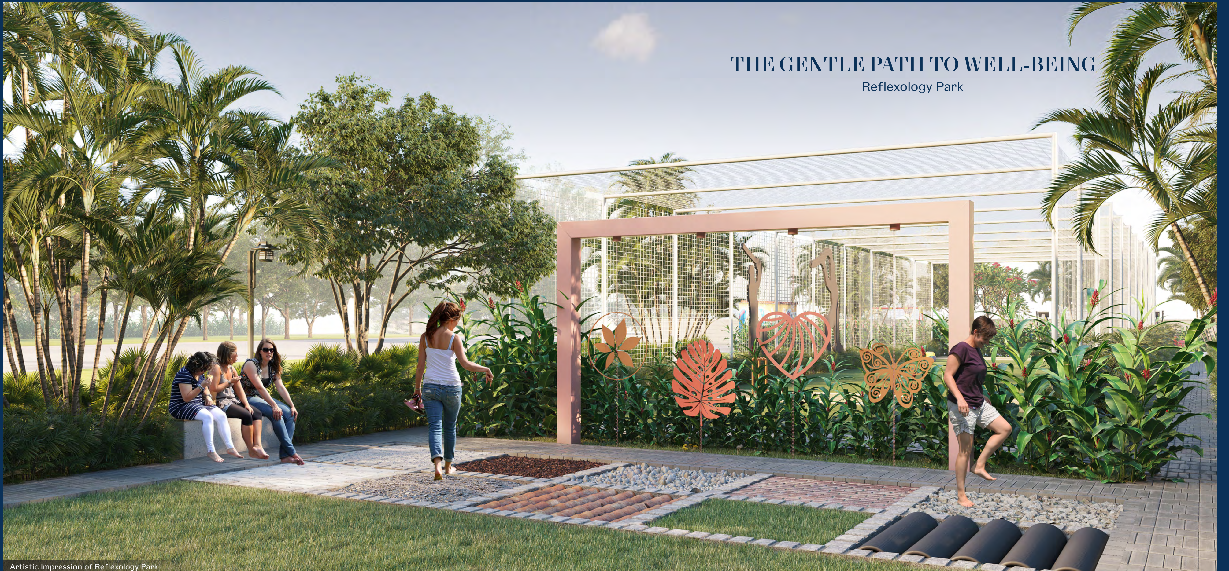
Artistic Impression of Reflexology Park