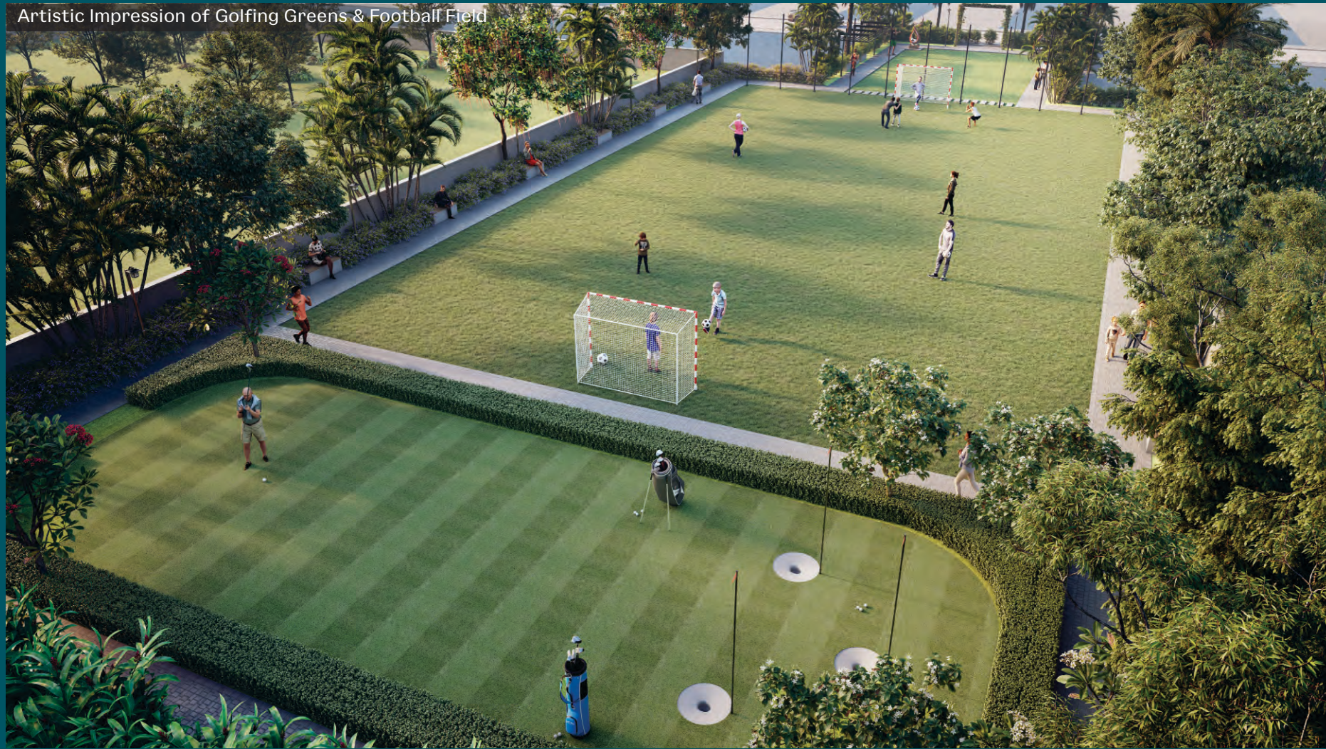
Artistic Impression of Golfing Greens & Football Field