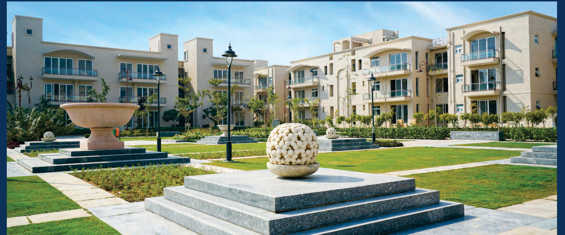
Amstoria - Sec. 102 & 102A, Gurugram

Our uncompromising integrity and years of experience in project development and management is unmatched.