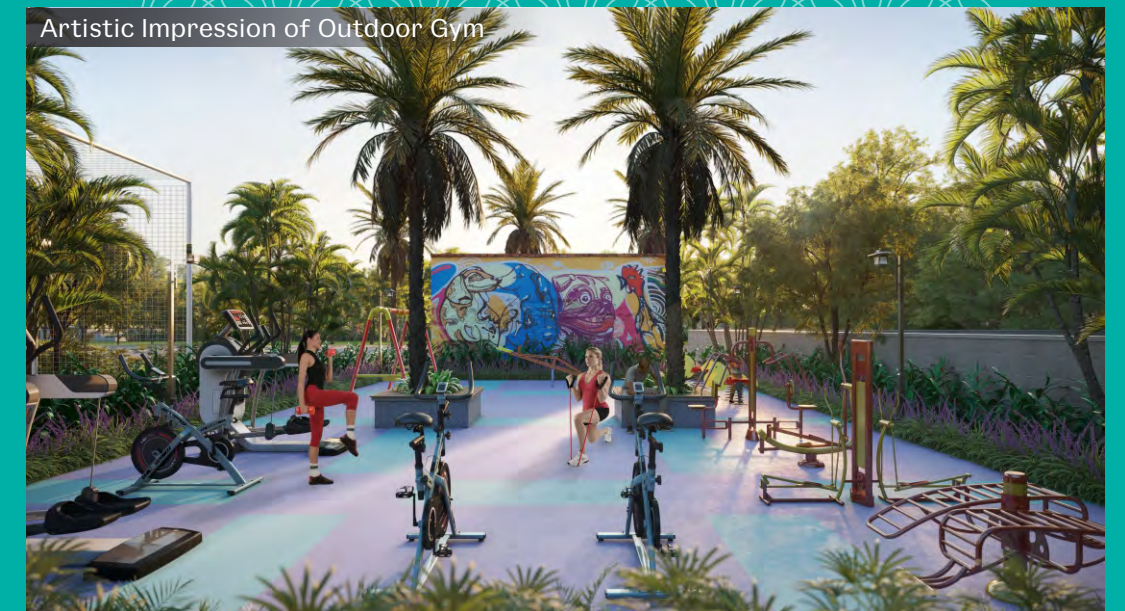
Artistic Impression of Outdoor Gym