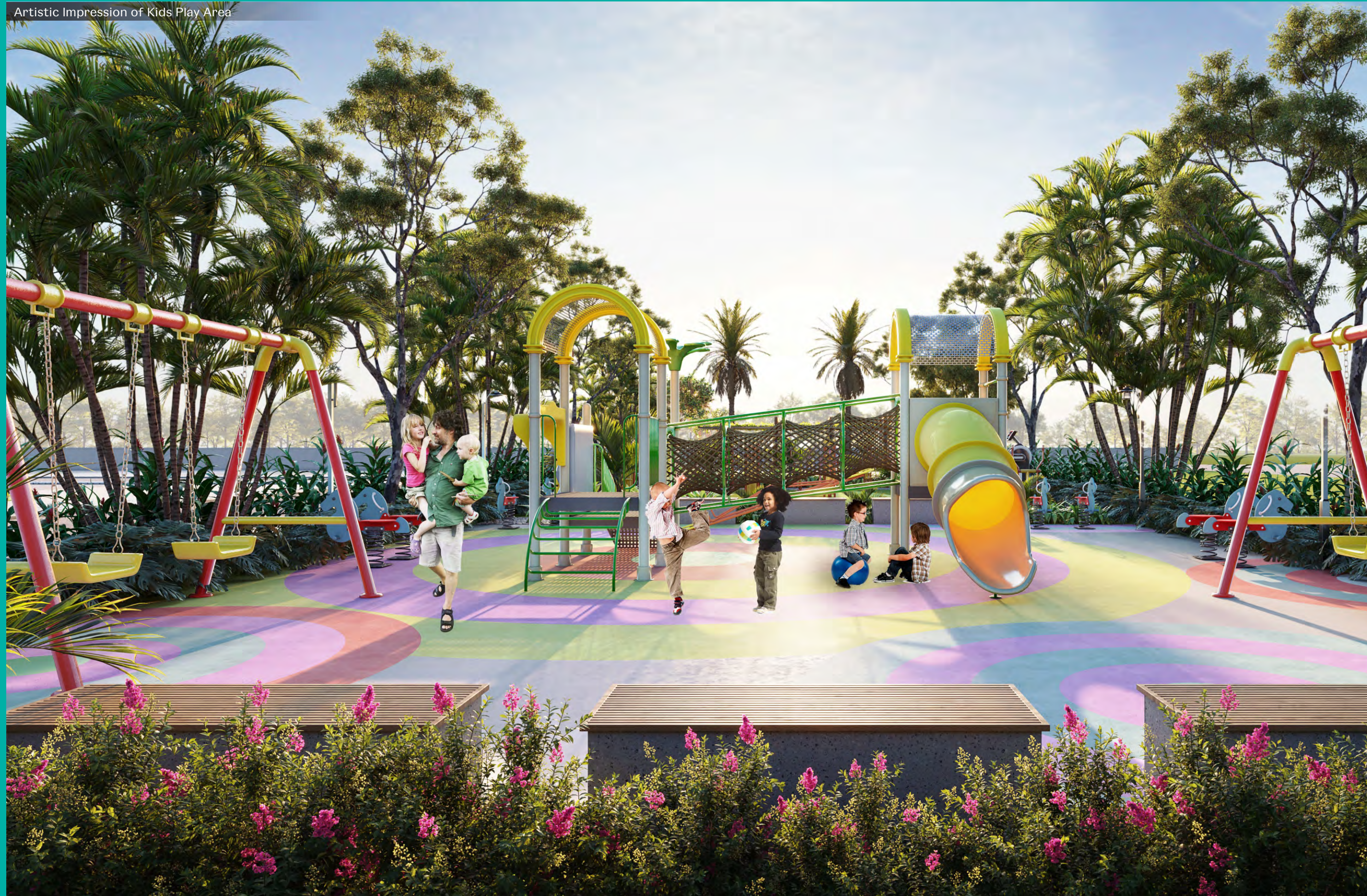
Artistic Impression of Kids Play Area